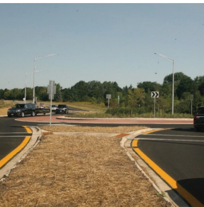
Burlington Road at Bolcum Road: Roundabout