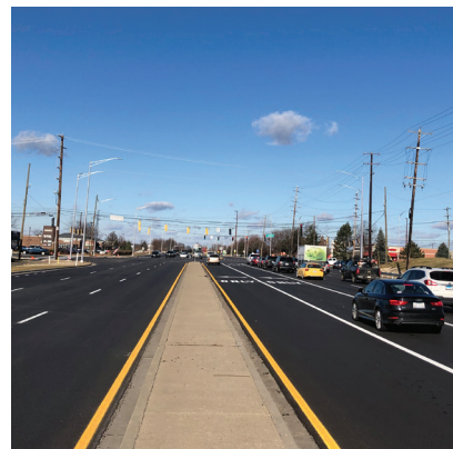
Randall Road at Stearns Road/McDonald Road: Intersection Improvement