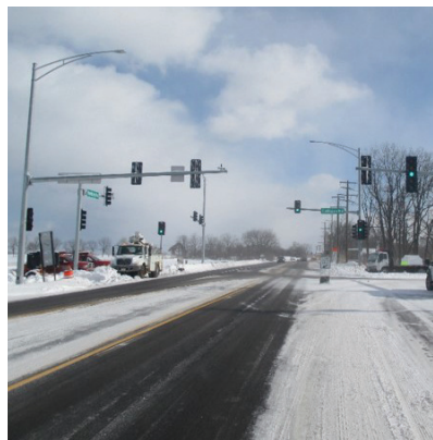
Huntley Road at Galligan Road: Intersection Improvement